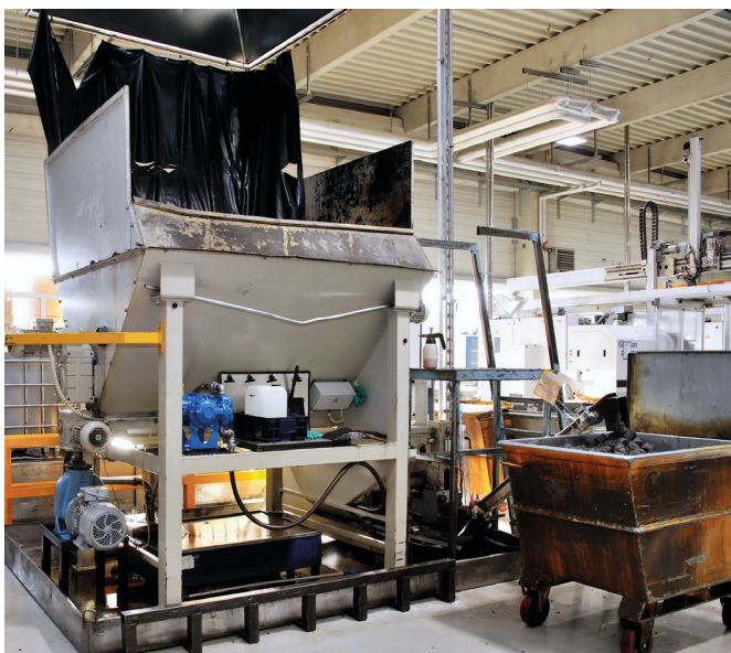
In continuous operation: The RUF briquetting system in the Thyrnau plant has recovered 1.5 million litres of grinding oil from grinding sludge since 2007.