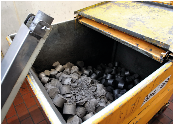
Via the outlet chute, the RUF system pushes the grinding sludge, which is compressed into briquettes and largely oil-free, directly into collection container.

„By pressing with the RUF machine we recover between 100 and 120 tons of oil per year from the grinding sludge“, explains Johann Zinöcker.